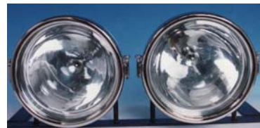
CAV Models B, E & F