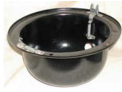
TP485 Back Bucket