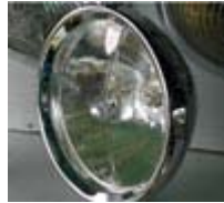
Marchal 8 inch